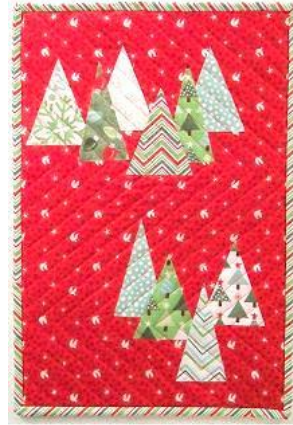
Christmas Tree - Free Quilt Block Pattern- Quilt Fabrication (internet)

NMQG Meeting December 11, 2025 @ 7:00 - 9:00 pm.