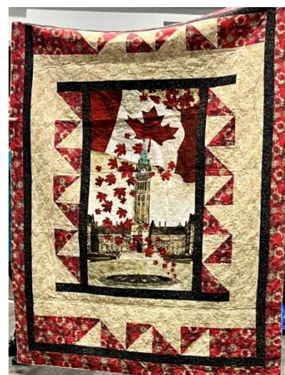
Canada Day Quilt by Dee R.