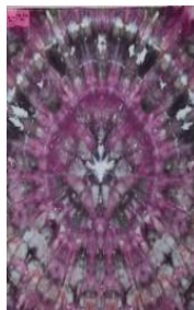
Sample of dyed fabrics