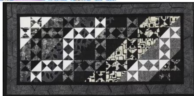
Two Tone Star Pattern Table Runner – American Patchwork & Quilting – Free Patterns