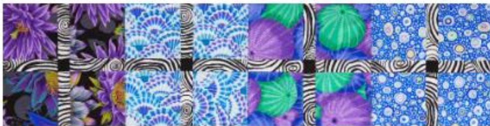
Striking Skinny Table Runner – American Patchwork & Quilting – Free Patterns