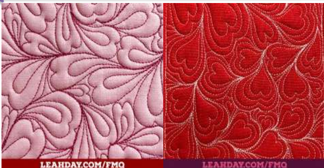
Free Motion Hearts: Instructions at Leahday.com (Permission received)

The quilt chosen by the membership will be submitted to the CQA/ACC Member Guild Challenge and displayed at Quilt Canada 2026 , proudly representing our guild and our shared love of quilting and country.